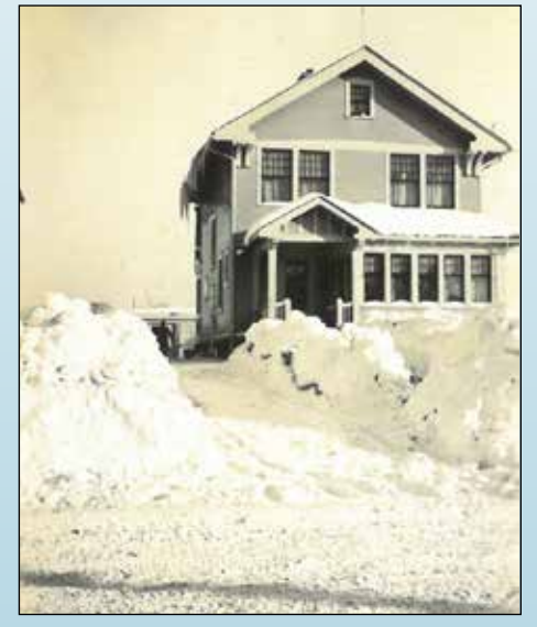
The driveway and sidewalk leading to this home on Niagara Falls Blvd. have a trench-like appearance about them, thanks to the huge piles of shoveled snow on each side.