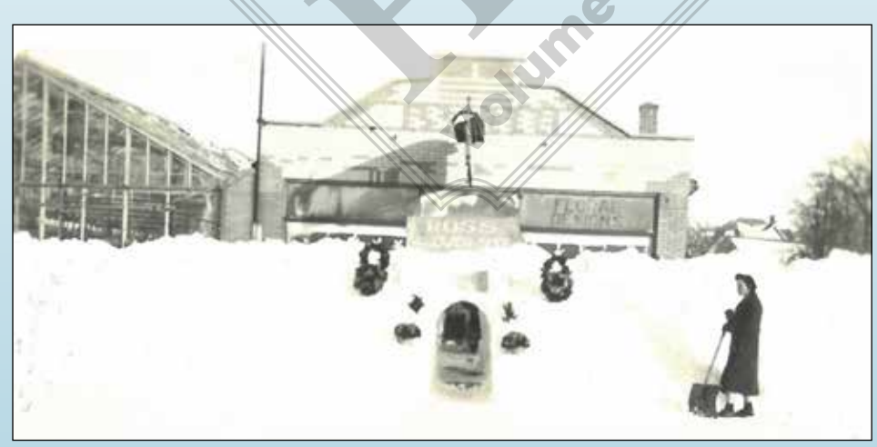
In this photo, an entrance archway seems to have been carved from the roadside snowdrifts to gain access to John V. Ross' floral shop in Kenmore. Located at 3735 Delaware Ave., just north of Sheridan Drive, the location is now the site of Ken-Ton Presbyterian Village.

While 30 inches of snow is certainly nothing to take lightly, I doubt that such an amount today would warrant calling in the Boy Scouts, given some of the spectacular amounts of snowfall caused by lake effect events of recent years. But it was interesting to learn that Western New York's reputation for wintry weather was fascinating audiences nationwide almost 90 years ago. While it is no newsreel, here are a few of the donated photographs from the storm.